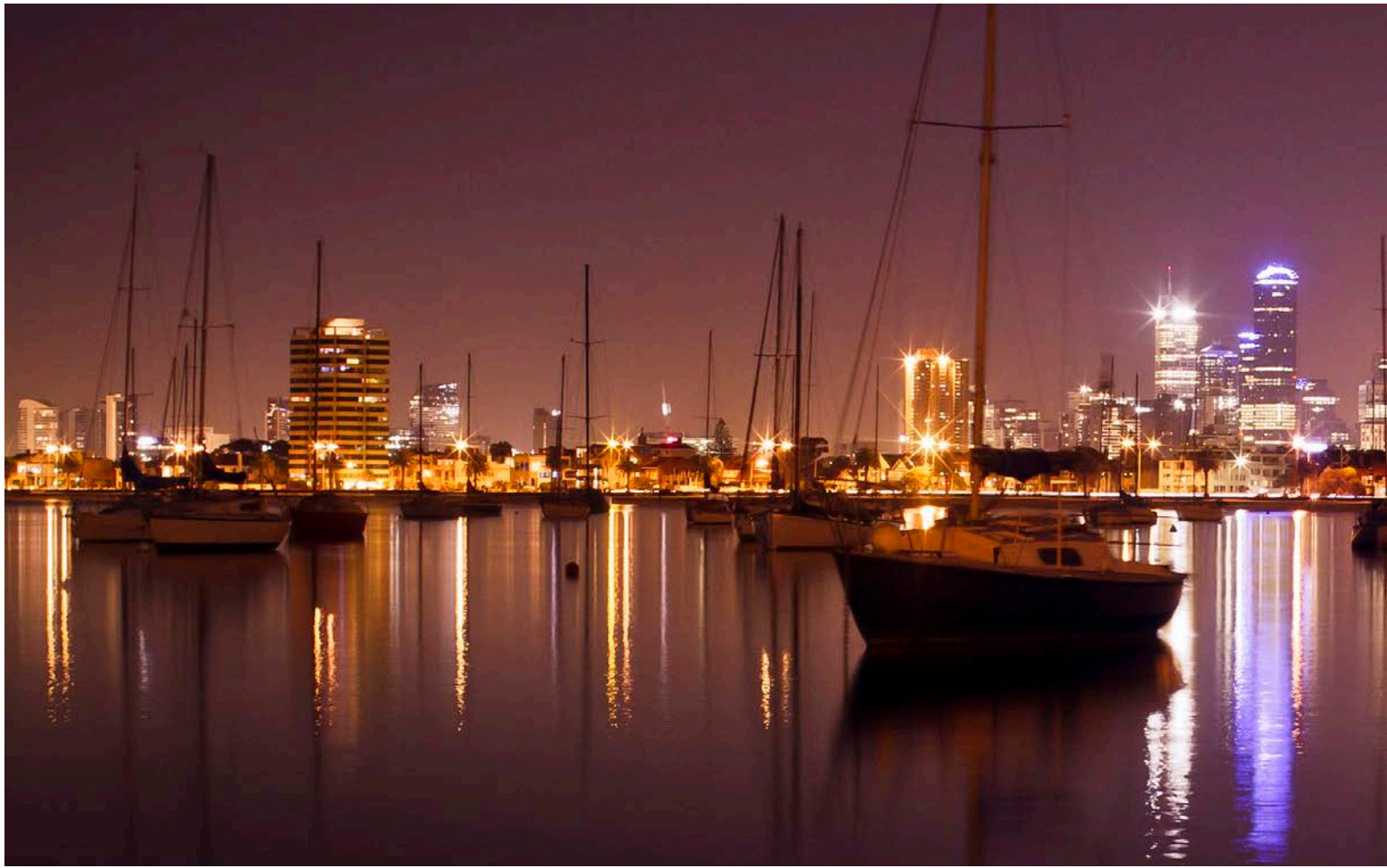
1 Melbourne Skyline from St. Kilda Pier, Victoria | S 37° 51' 53" E 144° 58' 01" | 0 msl