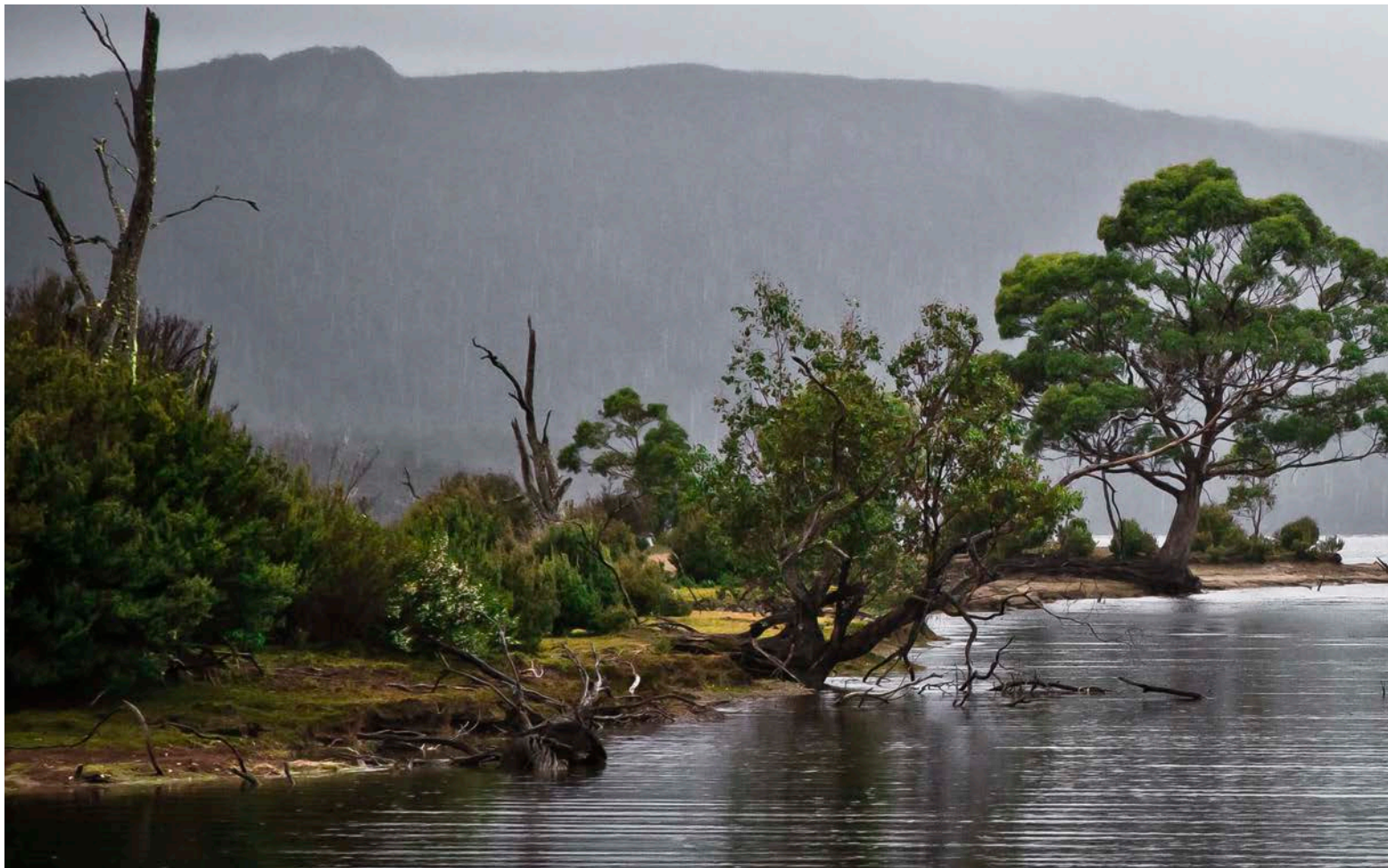
Lake St. Claire National Park, Tasmania | S 42° 0' 60" E 146° 6' 13" | 738 msl