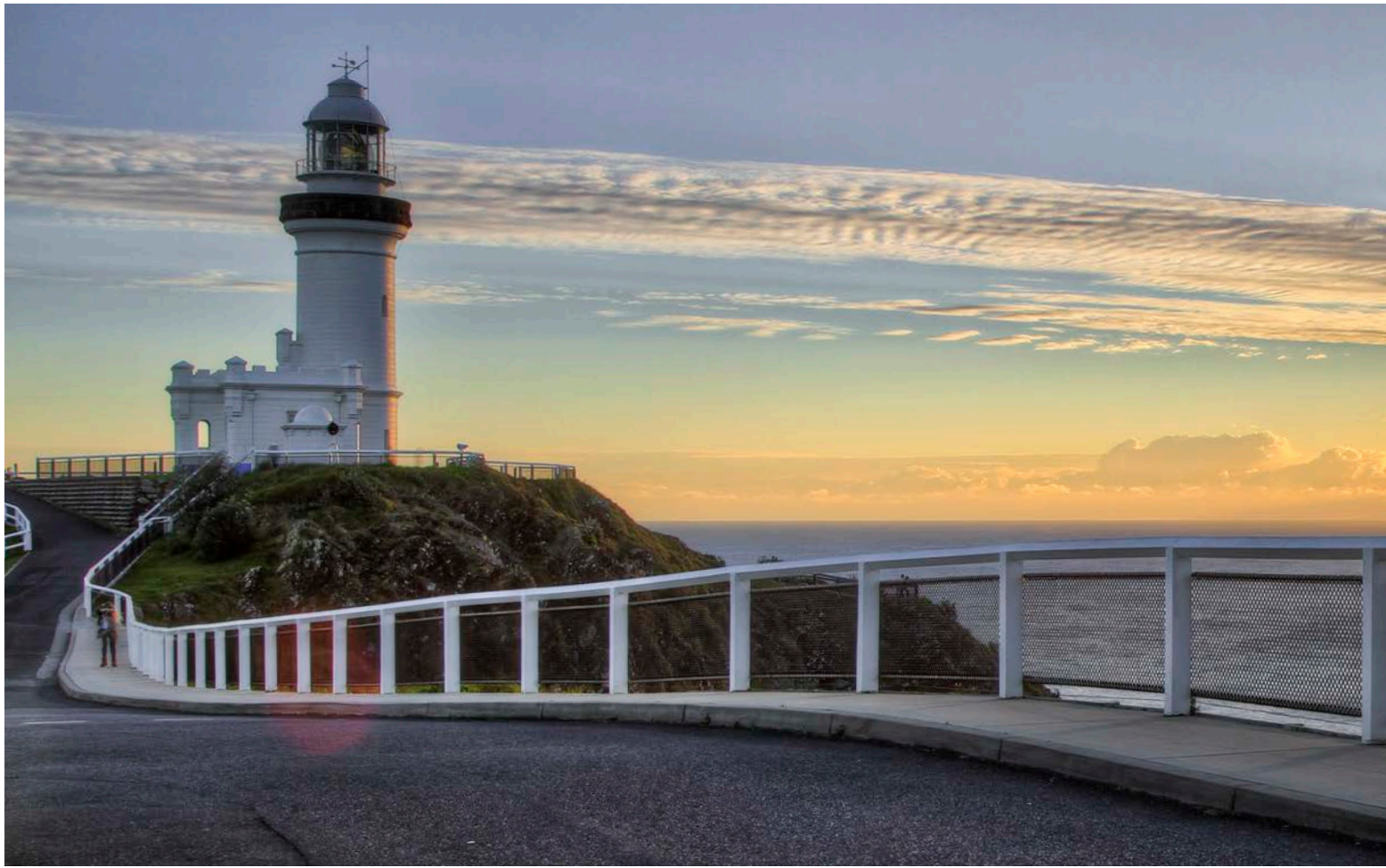
2 Byron Bay Lighthouse, Most Eastern Point of Australia, New South Wales | S 28° 38' 07" E 153° 38' 16" | 69 msl