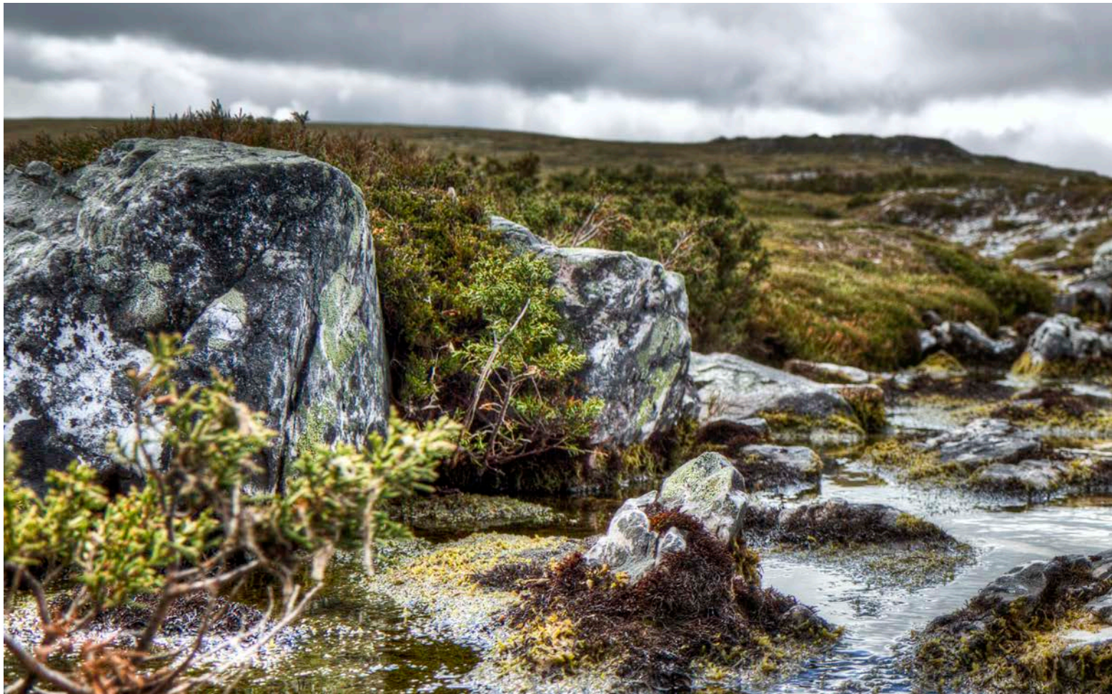
Cradle Mountain National Park, Tasmania | S 41° 40' 11" E 145° 56' 46" | 1261 msl