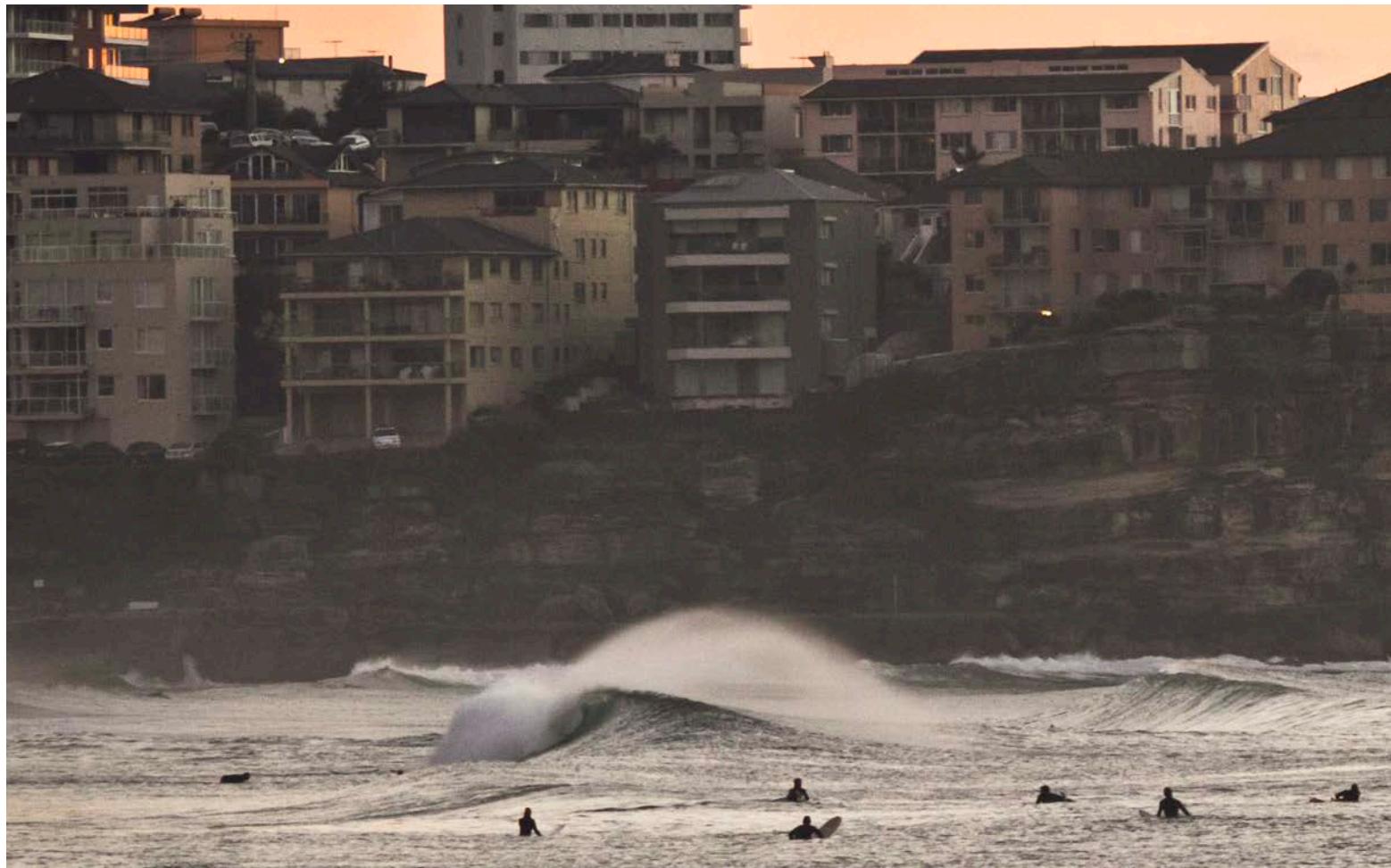
Manly Beach, New South Wales | S 33° 47' 40" E 151° 17' 17" | 0 msl